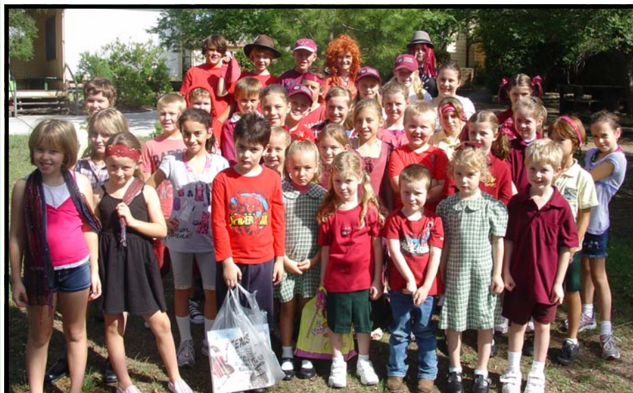
Below: Picture of our Maroon Day

"The beautiful thing about learning is nobody can take it away from you."